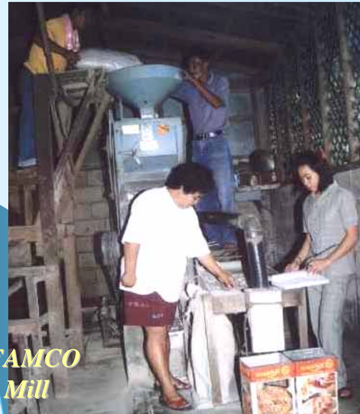
AGFAMCO Rice Mill