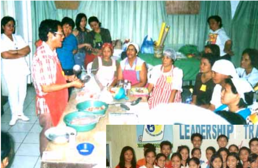
Processed Food Production Training