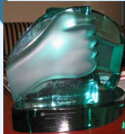
ECOP Grand Kapatid Award