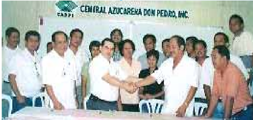
Collective Bargaining Agreement sealed with Batangas Labor Union