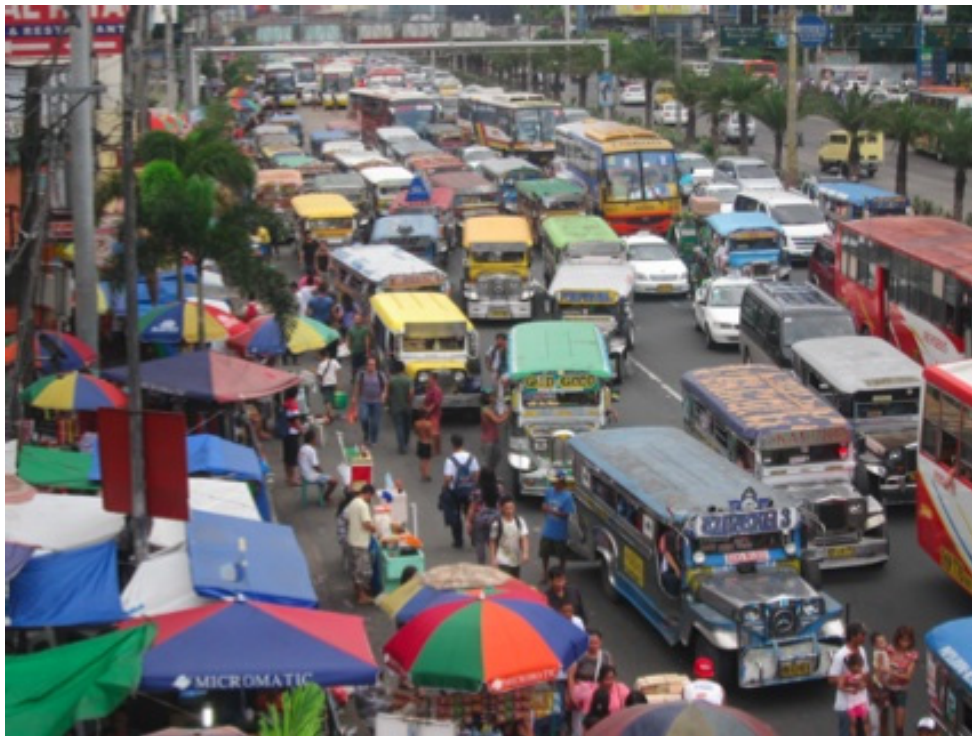
June 16 th, 2013

Jeepneys can use this section of EDSA, since there is no MRT going towards SM Mall of Asia further West (beyond the background of this picture). Many jeep passengers are transferring to/from two metro lines (MRT Taft Avenue station, end of the line, and LRT 1 EDSA station). Vendors are encroaching on the roadway, jeepneys jostle for position using 4 of the 6 lanes of traffic, and passengers have to find their way in traffic, even with children in their arms. This leaves little space for taxis, individual cars and buses.