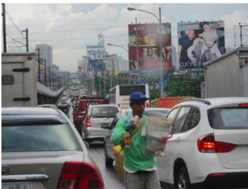
Figure 1: EDSA in Quezon City, North of Cubao, southbound traffic