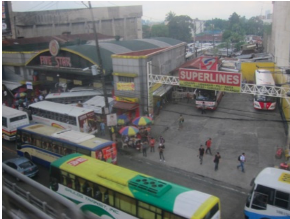
Figure 4: Private Bus Company Terminals alongside EDSA in Cubao, Quezon City viewed from the MRT train

7736, or about 60 percent, of the 13,067 registered buses plying Metro Manila roads are provincial buses, linking the Manila metropolitan area with regions across the Philippines. Even if other parts of Manila have bus terminals (Gil Puyat LRT 1 in Pasay, Sampaloc near Quiapo : LRT1/LRT 2 junction), most companies have established their terminals alongside EDSA, with major concentrations in Pasay (Saulog, Philtranco, Victory Liner, DLTB, Silverstar, Alfonso Liner..), and in the Cubao-Kamuning stretch (Superlines, Santrans, HM Transit, Baliwag Transit, Dominion Bus, De la Rosa Liner, Dagupan Bus, JAC Liner, JAM Transit, Victory Liner, Philtranco, DLTB, Daet Express, Lucena Bus, Florida Bus, Genesis, Five Star ...).