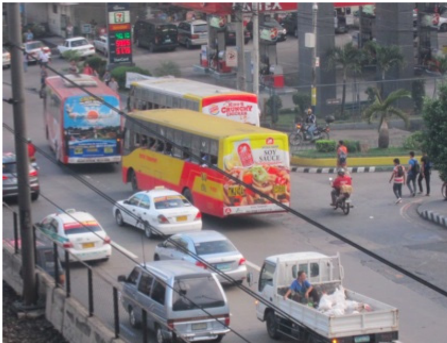
Figure 3: EDSA in Mandaluyong, from the Boni Avenue Station Overpass

from moving forward, in a wild concert of horns barely covering the voices of “konduktors” calling for passengers “Alabang! Alabang!”. 171 routes (67%) are run using part of EDSA.