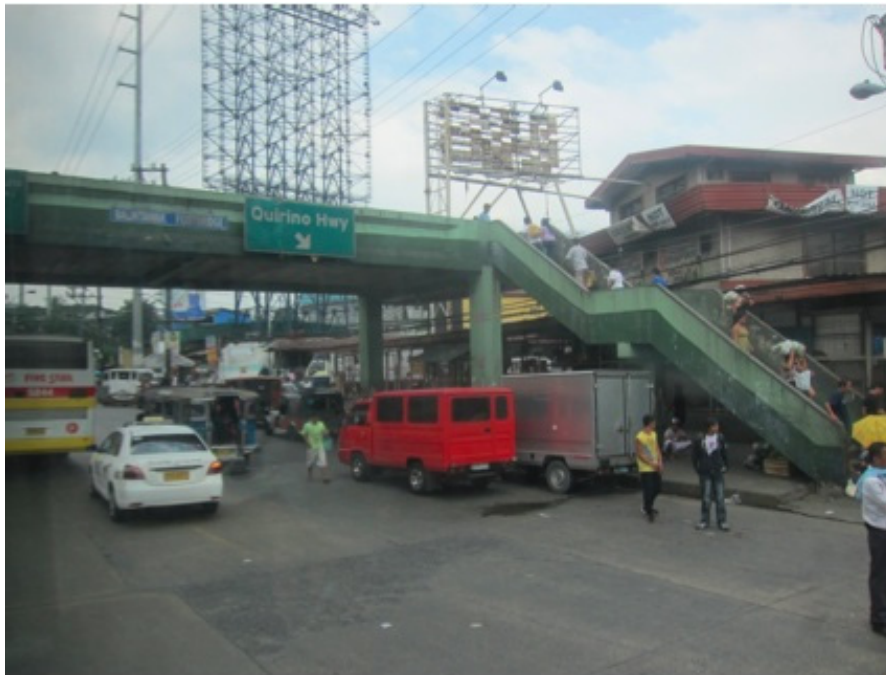
Figure 2: Footbridge over EDSA in Balintawak, Quezon City