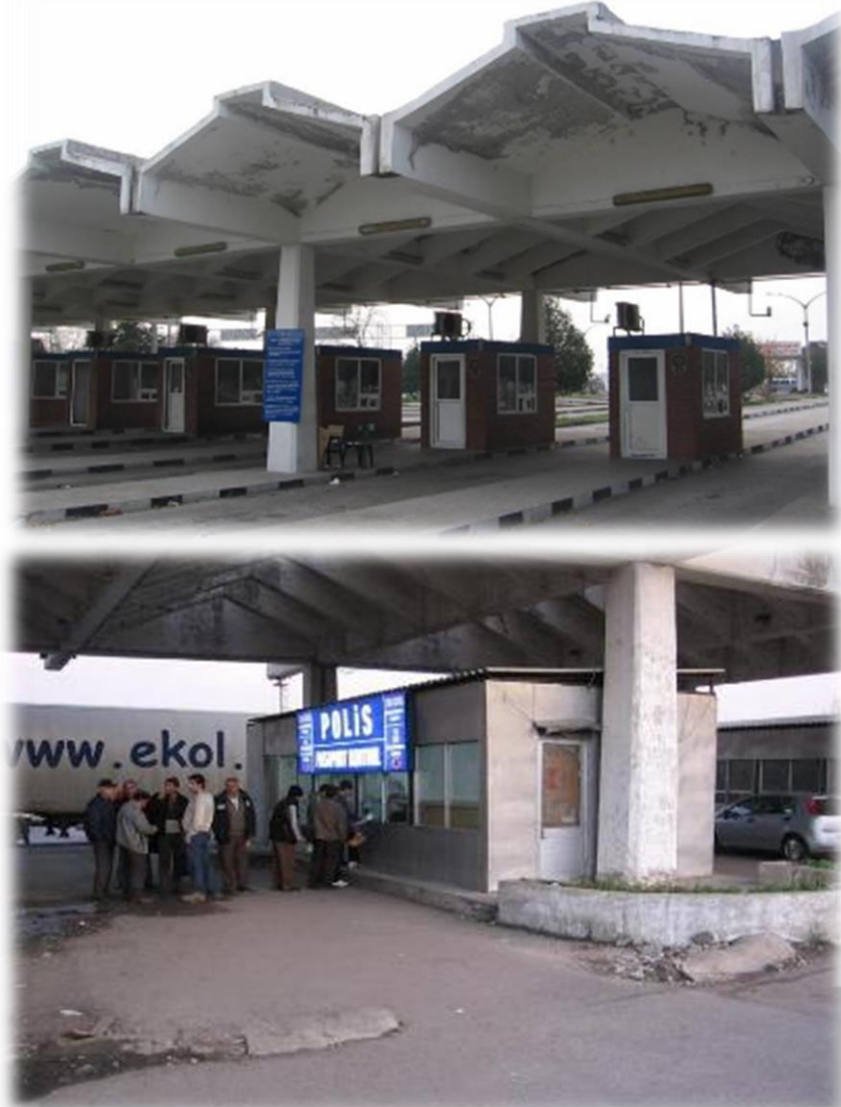
Kapıkule Before Modernization