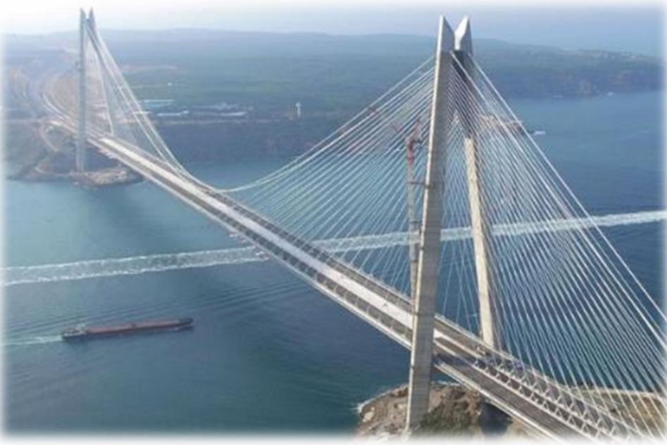
Çanakkale (Dardanelles) Bridge construction to start in 2018

3 rd Bridge on Bosphorus dedicated particularly for heavy goods trucks opened in August, 2016