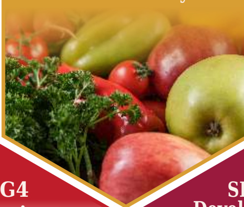
SDG2 Food Security