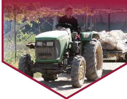
SDG8 Development of local agriculture