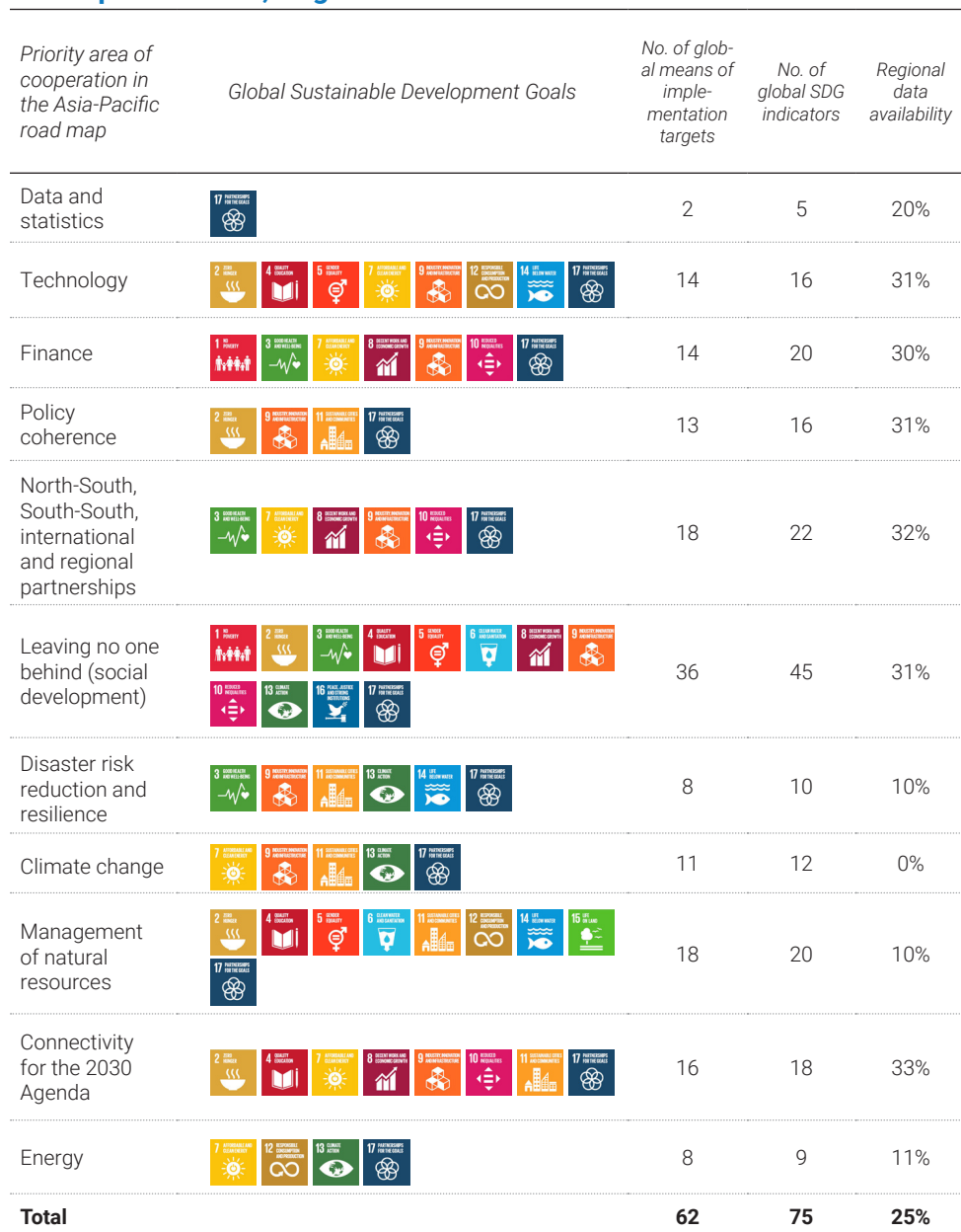
Table 1 Mapping of priority areas of cooperation to the global Sustainable Development Goals, targets and indicators