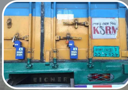
E-Seal affixed by Indian customs and cleared