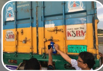
Seal Inspection, assessment and release of cargo in Delhi