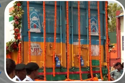
Truck reaches ICD Delhi