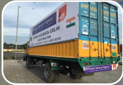
Cargo Truck received at Petrapole