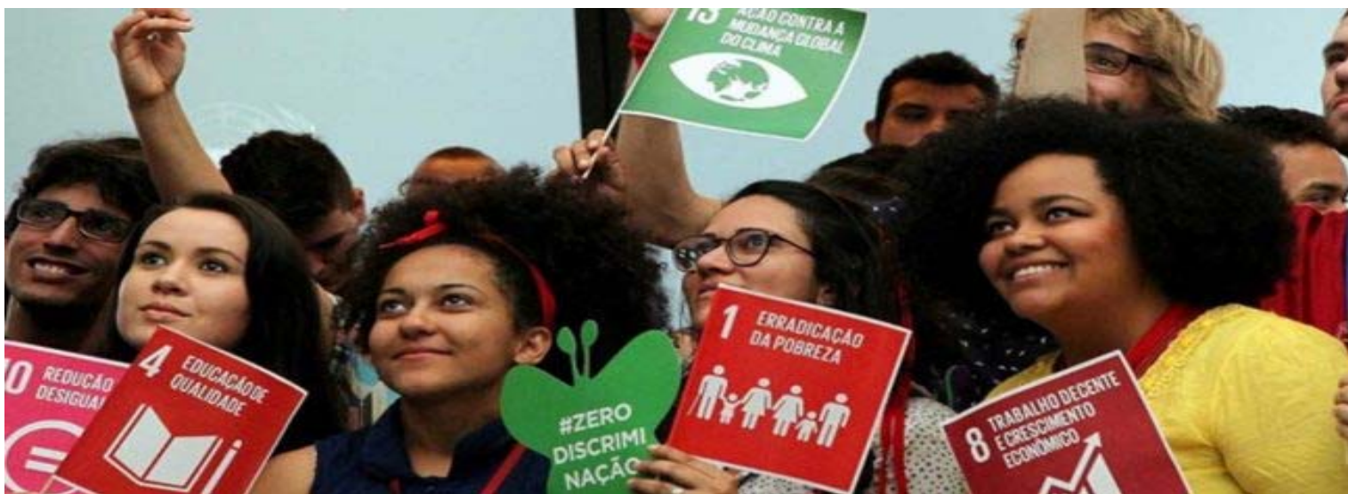
ESCAP SDG Help Desk regional consultation, 16 October 2017

Why do we need them? What is the mandate to the UN? What are the knowledge gaps? Where do we find tools, what are they?