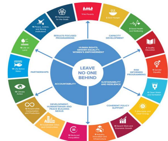
FIGURE 1 THE UN'S INTEGRATED COUNTRY-LEVEL RESPONSE TO ACHIEVE THE SDGS

https://undg.org/programme/undaf-companion-guidances/