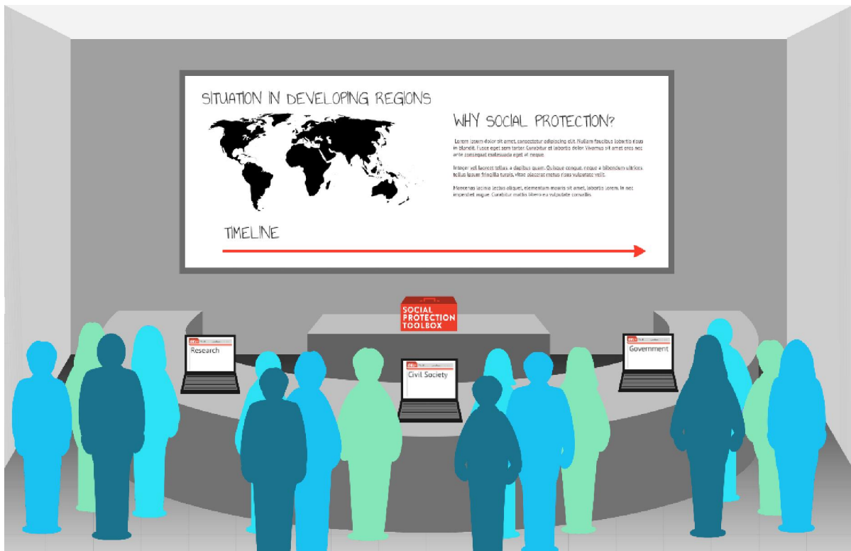
Figure 2 Presentation on social protection

This module is centered on an interactive multimedia presentation which encourages users to “explore” three aspects of social protection: The case is made for social protection through a survey of social and economic challenges faced by the different regions – Africa, Asia and the Pacific, Latin America and the Caribbean, and Western Asia. The key concepts of social protection are then elucidated and a timeline is provided depicting how social protection has come to emerge as a prominent development paradigm. Lastly, the perspectives of policymakers, civil society and researchers on enhancing and expanding social protection are presented.