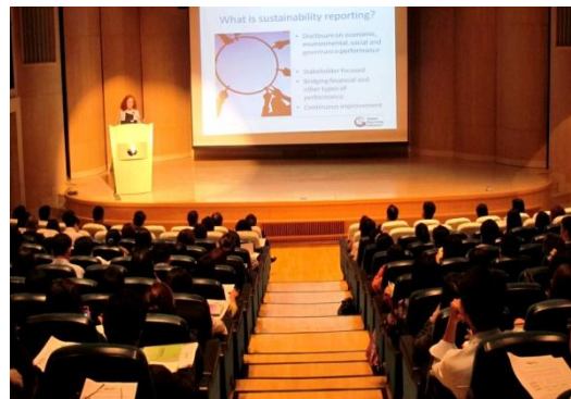
Quarterly SD Forums