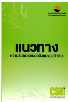
CSR Guidelines (2012)