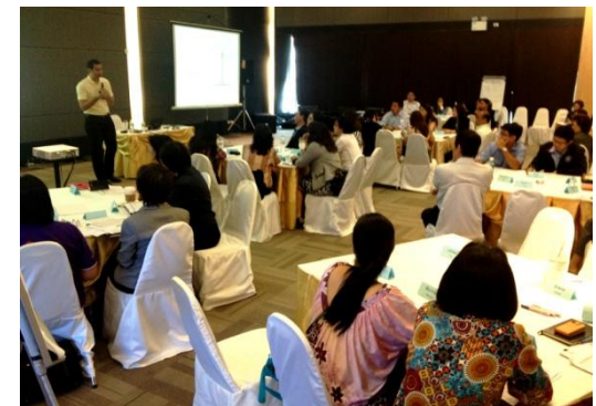
Training and workshops for listed firms