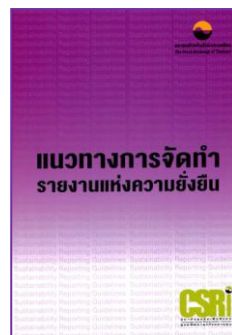
CSR Reporting Guidelines (2012)