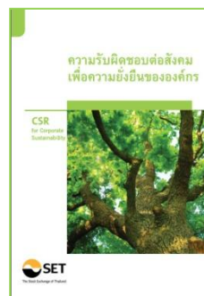
Sustainability Guidelines (2013)