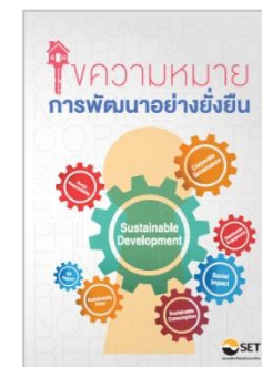
Terms & Definitions of Sustainability (2014)