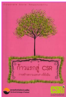
First Step to CSR (2010)