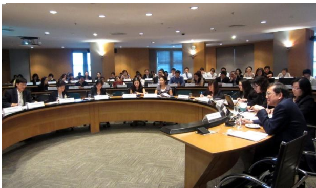
CEO Forums and Coaching workshops