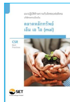
CSR Best Practice Series (2013)