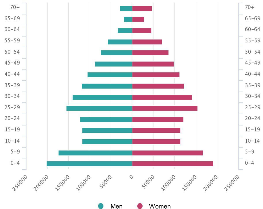
Population pyramid, Mongolia, 2017