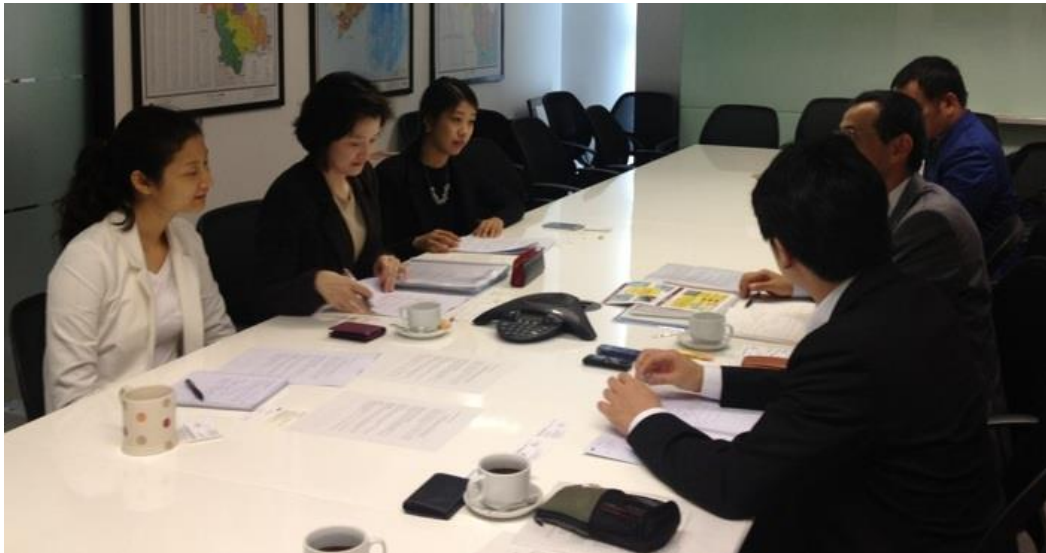
Vietnam Office of Export-Import Bank of Korea (2015)