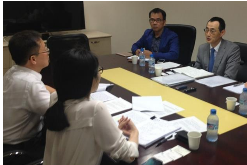
KOICA's Vietnam Office (2015)