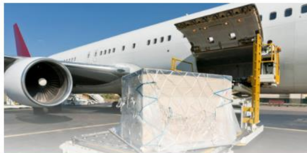
RDIF HAS FACILITATED THE EXCHANGE OF HUMANITARIAN AID BETWEEN RUSSIA AND THE UNITED STATES TO COMBAT CORONAVIRUS

RDIF - Russia's sovereign wealth fund assures InterSTATE cooperation in fighting COVID pandemic