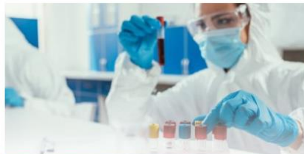
RDIF WAS ONE OF THE INITIATORS OF THE ALLIANCE AGAINST CORONAVIRUS