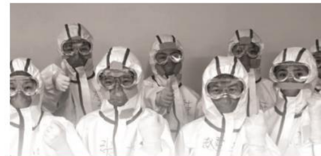
RDIF, ROSSIYA SEGODNYA AND SECHENOV UNIVERSITY PUBLISH A UNIQUE COVID-19 PREVENTION AND TREATMENT HANDBOOK