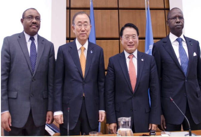
UN Secretary General, Mr. Ban Ki-Moon, UNIDO Director General LI Yong and the Prime Ministers of Ethiopia and Senegal, Hailemariam Desalegn and Mohammed Dionne, at the 2 nd ISID Forum in November 2014

UNIDO has developed a new type of assistance package for its Member States: the Programme for Country Partnerships (PCP). It is a custom-built partnership formula with each beneficiary country maintaining ownership of the complete process by defining its needs and required support and finally ensuring the success of its delivery.