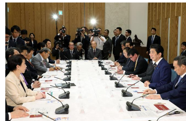
(The SDGs Promotion Headquarters)