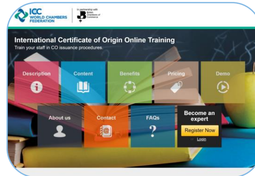
CO Online training