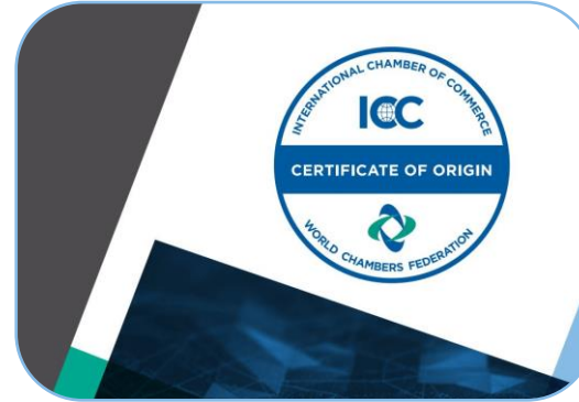
CO Accreditation Chain