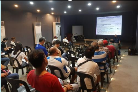
CDC Meeting, June 2022

SDG data in VLR – to be deployed in revised CLUP to be resubmitted to DHSUD