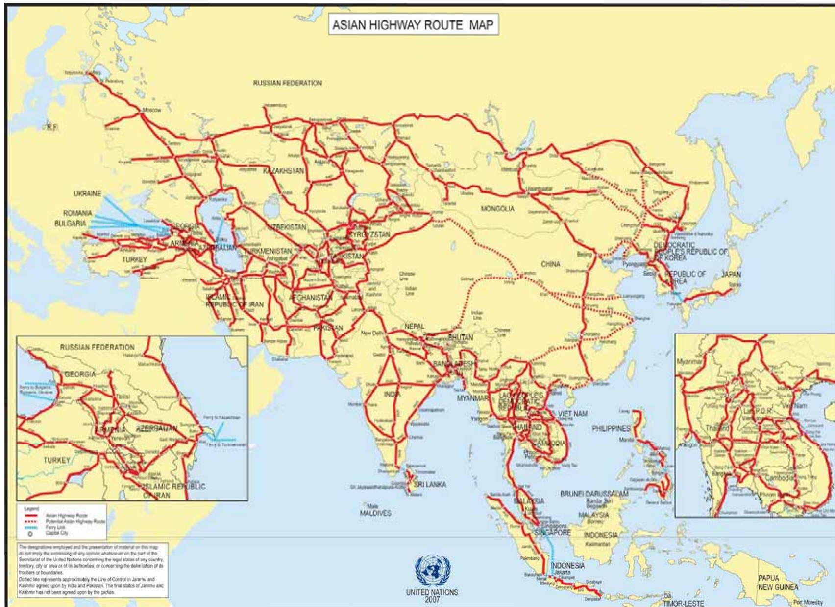
Figure 1. Asian Highway route map