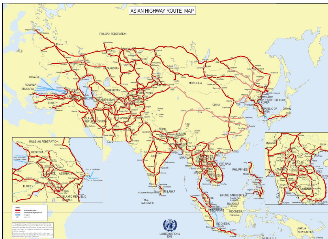
Figure 1: The Asian Highway Network

Further information on the current status of the Asian Highway network, by country and by route number, is summarized in tables 1 and 2.